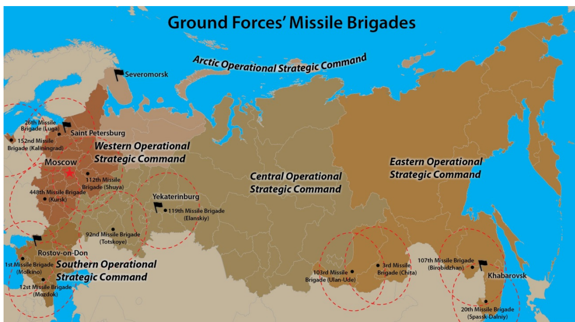
Figure 1.2 Ground Forces' Missile Brigades.