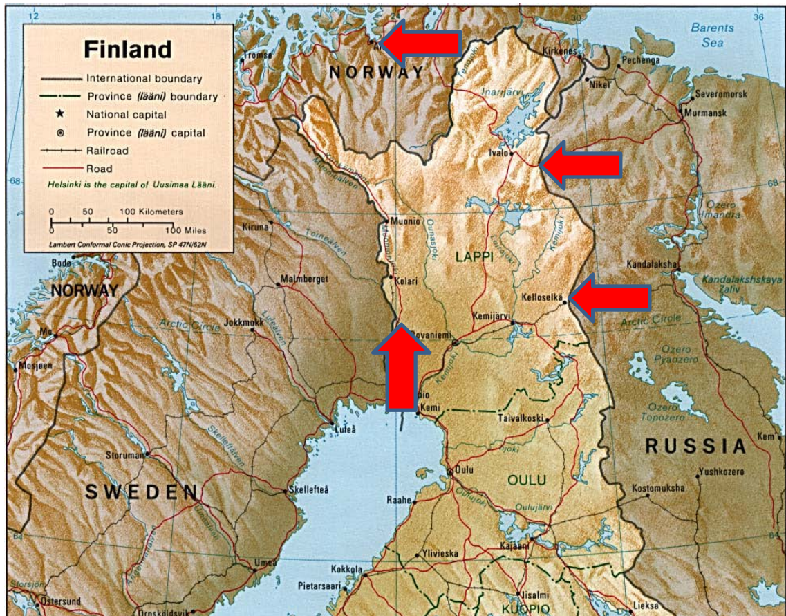
Figure 6.1 Map of Northern Finland, Sweden and Norway.

The difference is that this time the Russian advance on the Ivalo-Lakselv axis and the Kellosekä-Tornio axis does not stop at the border, but simply continues into Finland, with one mechanized division on each axis. Simultaneously, all military targets in their way are targeted from the air. The token forces on the border have no chance, and the Russian forces continue towards Lakselv and Tornio. When the two-pronged attack reaches Lakselv and Tornio, respectively, the southern division continues over Muonio–Kautokeino towards Alta, whereas the northern division advances along the Ivalo–Karasjok–Lakselv axis, approaching Alta from the east. After 10 days, the forces from the south and north meet outside Alta. The Russian forces have used every weapon system in their inventory robustly to ensure a rapid advance towards Alta, but have not targeted military objectives that are not in their way nor civilian targets. After 12 days, the Russian forces have control over the territory from Northern Finland and Norway, including a small bit of Sweden.